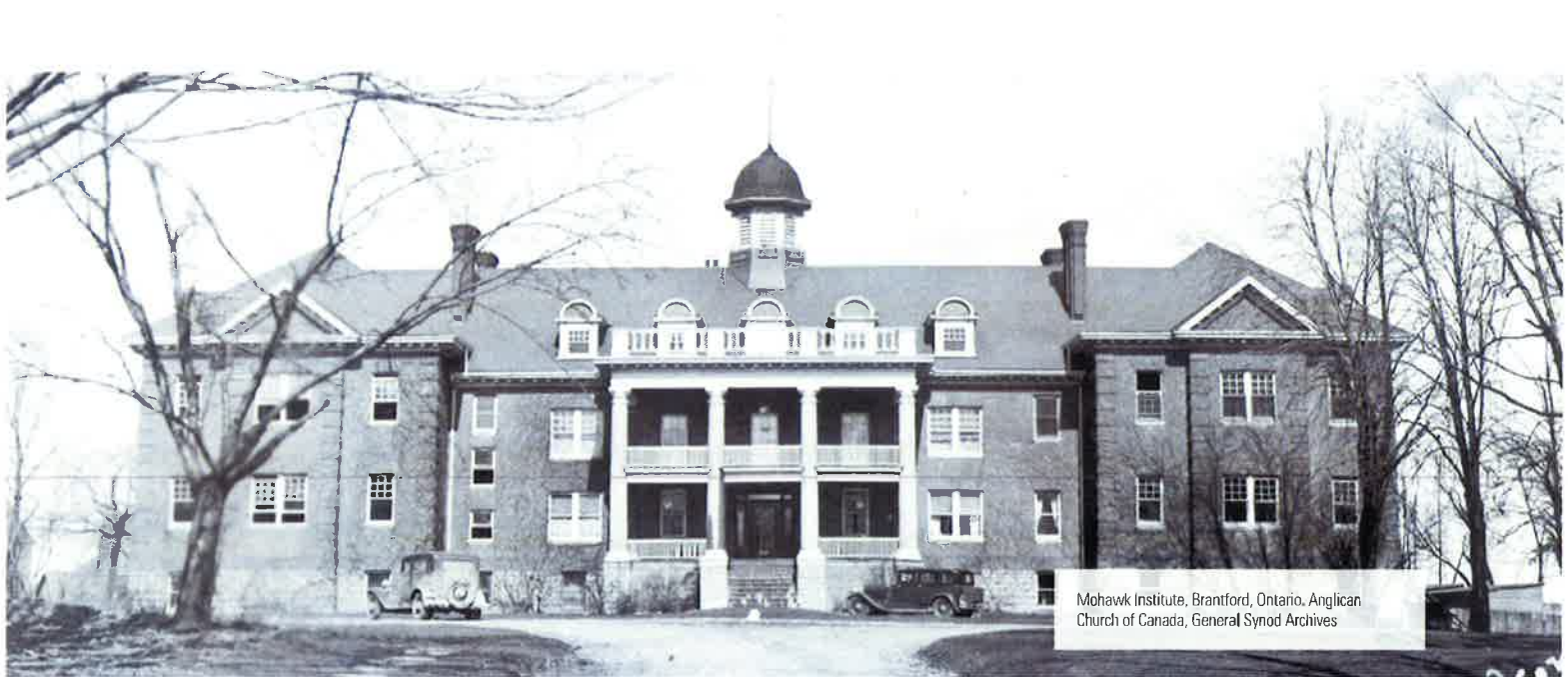
Mohawk Institute, Brantford, Ontario, Anglican Church of Canada, General Synod Archives

A primary objective of the school system over a century of operation was to aggressively assimilate children into "mainstream" Canada. The Residential School System operated alongside a number of policies meant for the assimilation and control of Métis, First Nations and Inuit.